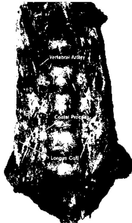
FIGURE 3. Costal process of the foramina transversarium is identified, as well as the vertebral artery.

The height of the distracted disc space was shortest at C2-C3 and C6-C7 (average, 8.5 mm) (Table 3). The distance from the tip of the LP to the VB above (UP-VB) after distraction was greatest at C4-C5 (4.5 mm) (Table 3). After distraction, the nerve root was located either above or below the UP. Only at the C2-C3 interspace was the nerve always above the