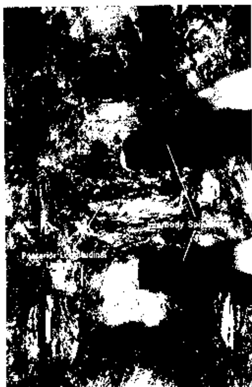
FIGURE 5. The posterior longitudinal ligament was excised after the dissection of the VBs.

is unknown because of underreporting of such occurrences (17). The increased uses of anterior instrumentation and more aggressive anterior cervical procedures portend more frequent mishaps. The best means of preventing complications is possessing knowledge of the surrounding anatomy that is not in direct view, but is in harm's way. To gain this understanding, we used cervical spines from six adult cadavers to measure the landmarks encountered in this approach, placing an emphasis on the bony surroundings of the neurovascular elements in the lateral disc space. By opening the disc space using a VB screw distractor (Ruggles), we also determined the extent to which the nerve root and VA are exposed to injury.