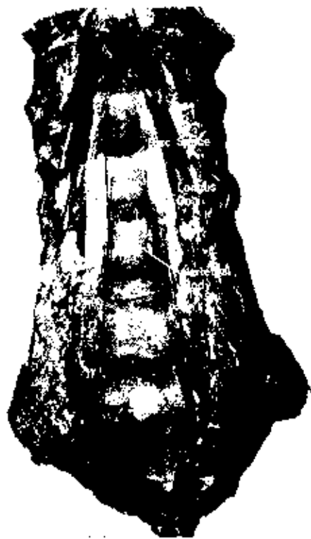
FIGURE 1. All soft tissue, superficial to the longus colli muscle, removed. Distance between the medial borders of the longus colli muscle was measured at each interspace.

The uncinate processes (UPs) ("uncus," Latin for "hooked" or "curved") are bony excrescences located laterally and posterolaterally at C3-C7 (3, 35). A line extending laterally from the rostral edge of each VB was marked (a). The bony prominence extending above this line was defined as the UP. A perpendicular line (b) drawn from line (a) to the cranial tip of