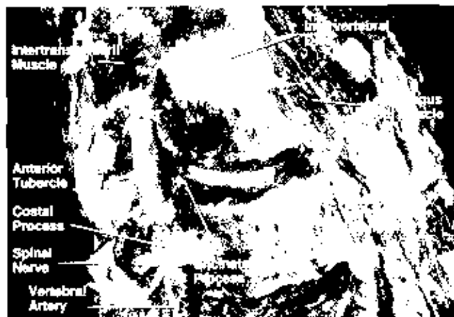
FIGURE 7. Longus colli muscle (right side) has been removed to expose the C.P.s.

the biomechanical characteristics of bone, annulus, ligament, or the motion segment as a single unit (16, 24, 31, 41, 47).