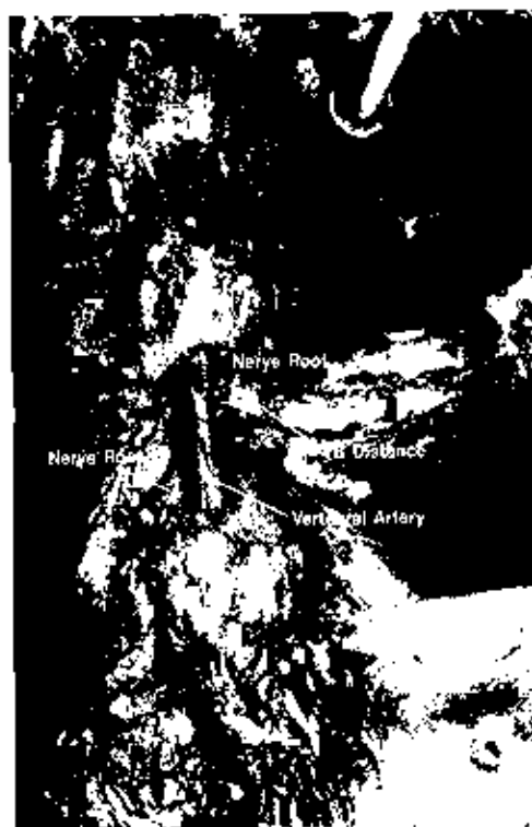
FIGURE 6. Demonstration of the Caspar technique for VB distraction. The distraction screws are seated, UP-VB distance is demonstrated. The nerve root after distraction is well defined.

The longus colli muscles extend longitudinally along the ventral surface of the VBs (Fig. 1). The paired muscles are present from C1 to the upper thoracic spine (13) and are attached laterally to the anterior tubercles at the lateral aspect of the CP. The medial borders of these muscles have been suggested as landmarks for determining safe lateral margins for a cervical corpectomy (14). Our data demonstrate that the distance between these muscles increases in a caudal direction. However, considerable variability occurred at each level; therefore, using the medial border of the longus colli as a landmark should be done with caution because doing so may leave behind bone that should be removed. The preferred procedure is to dissect the longus colli muscles to their lateral margins to determine the true bony surfaces of the VBs to be removed. Subperiosteal dissection of the muscles to the beginning of the CP provides sufficient exposure in most cases. If more direct visualization of the lateral boundary of the VB