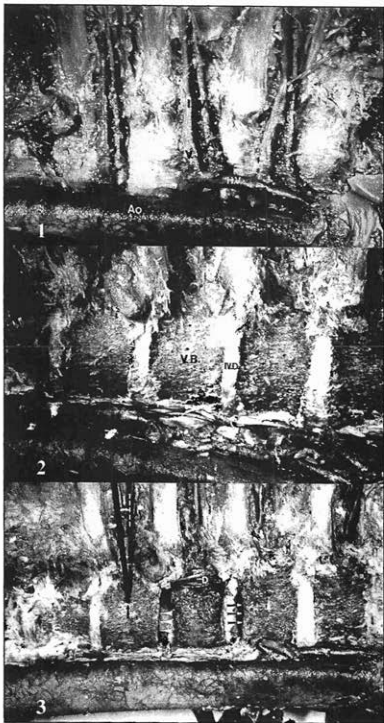
Figs 1-3. Demonstration of the technique using a cadaver specimen. For details, see text. Ao, Aorta; H.V., Hemiazygos vein; I.V.(A;V), Intercostal vessels (artery; vein); IV.D., Intervertebral disc; IV.S., Intervertebral space; V.B., Vertebral body; D, Dura; P, Pedicle; R, Rod (TSRH, Daneke, Memphis, TN); S, Screw(s) (TSRH, Daneke, Memphis, TN.); M.R., Malleable retractor; P.C., Polymerizing cement (Aneuroplastic™ Codman).