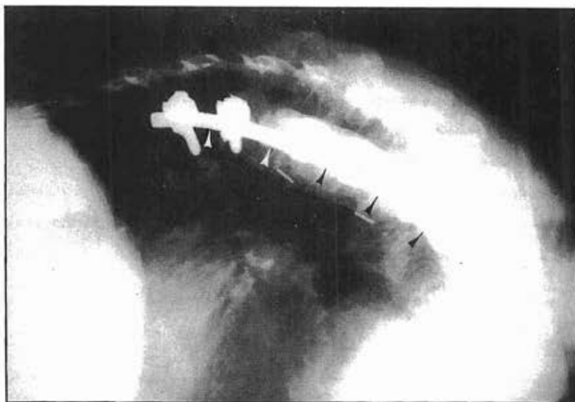
Fig 7. Postoperative X-ray of a patient.